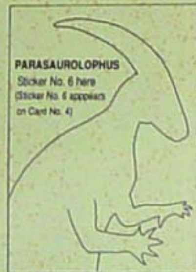
PARASAUROLOPHUS Sticker No. 6 here (Sticker No. 6 appears on Card No. 4)

This large plant-eater (around 10 metres long) lived over 120 million years ago and was one of the first dinosaurs ever discovered. Many skeletons have been found across Europe, Africa and Asia. He had well developed hands for holding food and a large spike on each thumb, which was probably used as a weapon. His extra long tongue would have been useful for pulling plants into his mouth which held several rows of teeth along each jaw. The Iguanodon had a very strong tail and moved about on its hind legs. The name means 'iguana tooth', even though it is no relation to the iguana.