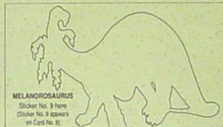
MELANOROSAURUS Sticker No. 9 here (Sticker No. 9 appears on Card No. 8)