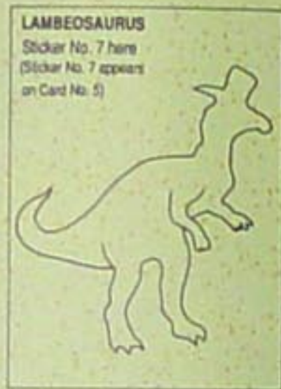
LAMBEOSAURUS Sticker No. 7 here (Sticker No. 7 appears on Card No. 5)